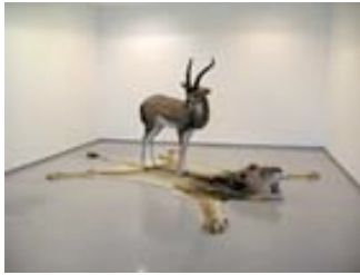
artist: Lillian Lykiardopoulou title: Asymmetric endeavor, 2008 size/material: polystyrene foam, acrylic fabric, spray, acrylic paint, clay, gauze; 350x230x140cm 05-Qbox-LillianLykiardopoulou.jpg (2,0 MB / CMYK / ZIP)