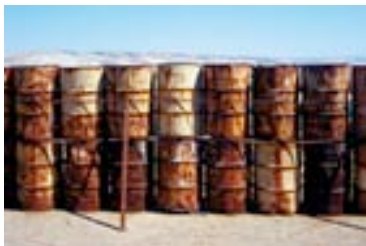
artist: Evron Assaf title: Untitled, 2006 size/material: C-print, 100X150cm 06-TheHeder-EvronAssaf.jpg (2,5 MB / CMYK / ZIP)