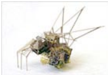
artist: Stephanie Backes title: Station, 2008 size/material: Wood, Paper, Plastic, Fimo; 2008 08-loopraum-JuliaBackes.jpg (1,2 MB / CMYK / ZIP)