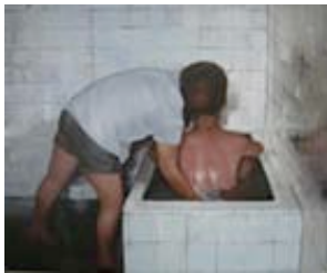
artist: Oana Farcas title: Chemistry to burn bittersweet romance, 2008 size/material: oil/canvas, 50x60cm 07-IVAN-OanaFarcas.jpg (1,7 MB / CMYK / ZIP)